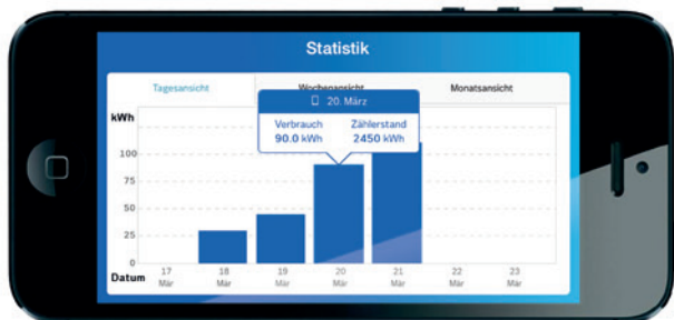
Example: statistical display of energy consumption