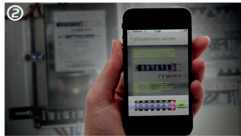
2. Scan meter reading