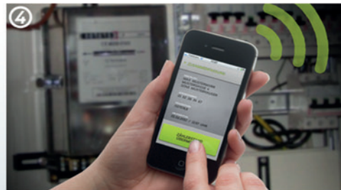
4. Save data and transmit meter reading