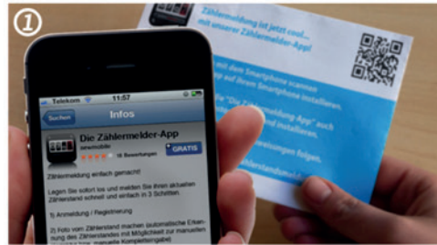
1. Register one-time